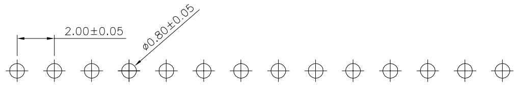
Recommended PCB Layout

Current Rating:1.5 Amp Withstand Voltage:500V AC/Minute Contact Resistance:20 Milliohms Max. Insulation Resistance:1000 Megaohms Min. Operation Temperature:-40°C~+105°C Contact:Brass,Gold Flash Over Nickel Insulator:PA6T+30%G.F.(UL94V-0),Black RoHS Compliant